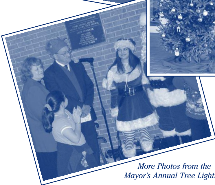
More Photos from the Mayor's Annual Tree Lighting