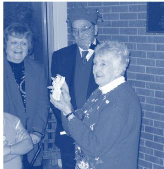
A great time of fun was had by all children, both young and old, who attended our annual Christmas Tree Lighting.